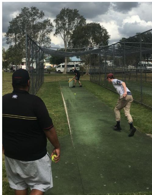
Boys are feeling the Ashes cricket vibe.