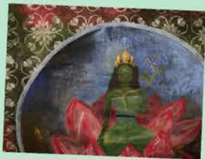
Unveiling of Tara